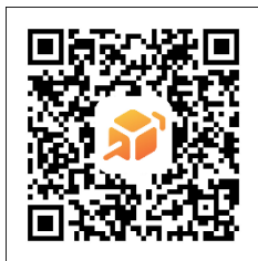
RSVP for the Event

Please RSVP no later than March 12, 2026.