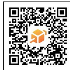
Donate to the Scholarship Fund

Can also RSVP at Chapter Website: https://www.nwmimoaa.com/events.html